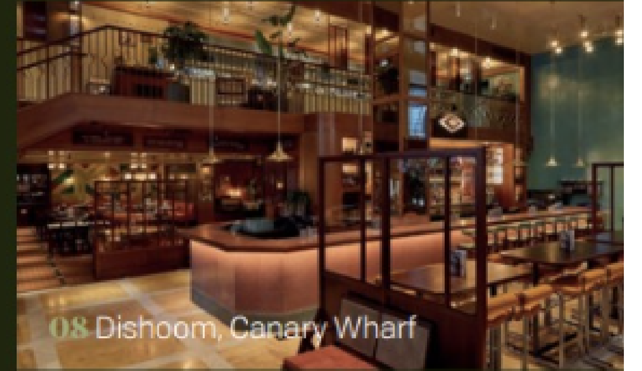
08 Dishoom, Canary Wharf